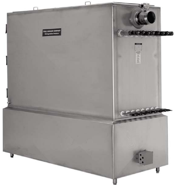
4 X 8 CHILLER SIZING CHART

Distribution pans are available in extra-low, low, and high flow rates, based on chilled water usage. Extra-low flow rates range from 6 to 16 gpm, low flow rates range from 13 to 24 gpm, and high flow rates range from 25 to 48 gpm (per evaporator).