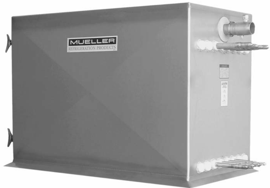
TANKLESS CHILLER SIZING CHART

Units are available in both 3 x 5 and 4 x 8 evaporators from 8- to 24-plate cabinets.